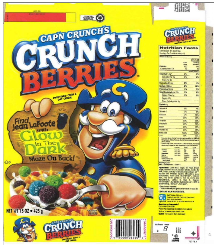
Figure 1 - Image of front and side display panel 1

In or about 1968, The Quaker Oats Company (“Quaker Oats”), now a unit of PepsiCo, began manufacturing and marketing a cereal known as Cap’n Crunch’s Crunch Berries (“Cap’n Crunch”). (First Am. Compl. (“FAC”) ¶ 2, Ex. B at 24.) As shown in fig. 1 below, the front display panel of the cereal box bears the product name, “Cap’n Crunch’s Crunch Berries.” Immediately below is a product description, which states: “SWEETENED CORN & OAT CEREAL.” The display panel also depicts a ship’s captain in cartoon form standing behind a bowl of cereal, and holding a spoonful of multi-colored Crunch Berries. (Id. ¶ 11.) Plaintiff alleges that “the colorful Crunchberries [sic] on the [cereal box], combined with the ‘berry’ in the Product name, conveys only one message: that Cap’n Crunch has some nutritional value derived from fruit.” (Id. ¶ 12.)